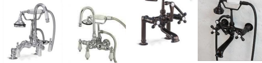
Edwardian all brass faucet