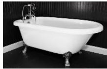
Classic Flat Top